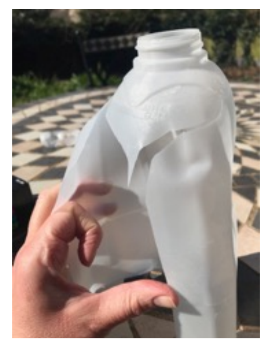
Cut up the middle of the flat side of the bottle (Opposite the handle).

Just before you reach the curved top cut a V shape that makes the birds head. Cut around to either side of the lid of the bottle in a curve to complete this shape.