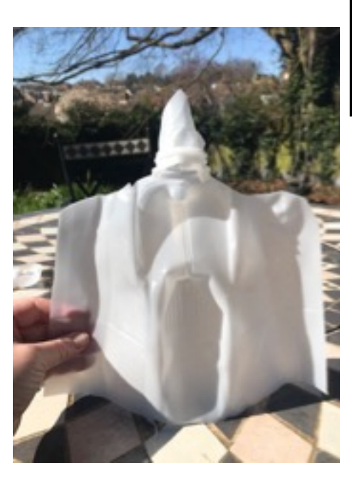
Open up the bottle along the first cut and bend the sides back. You can start to see the bird taking shape!

Fold the v shape UNDER and UP through the spout and pull it tight to create the birds head! Ace!